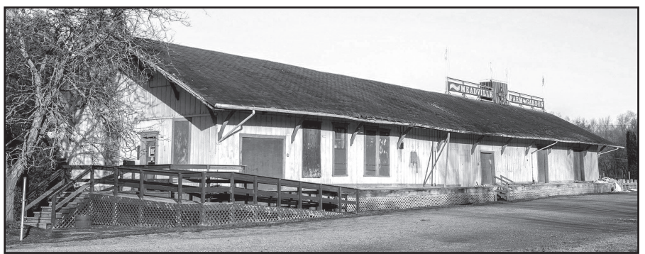
The former Meadville Farm & Garden Meadville store shortly after being purchased by the French Creek Valley Railroad Historical Society. It was originally a Meadville Railway passenger and freight depot.

For a glance at what has been done, check out the photographs throughout this issue.