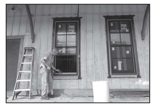
First two windows are installed on the depot.