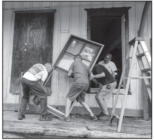
Crew hanging the first new window at the Meadville Railroad Depot.