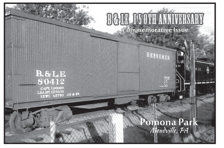
B & LE 150th Anniversary Postcard